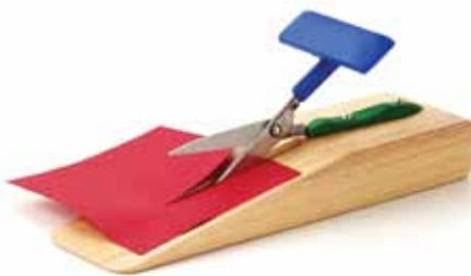
TABLE TOP SCISSORS - WOODEN

Table top scissors on a plastic or wooden base with rubber non-slips. Suitable for use by children learning to use scissors or with only one functional hand.