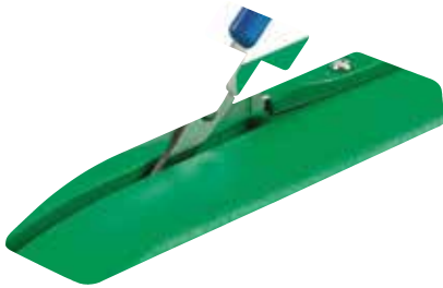
TABLE TOP SCISSORS - PLASTIC

Table top scissors on a plastic or wooden base with rubber non-slips. Suitable for use by children learning to use scissors or with only one functional hand.